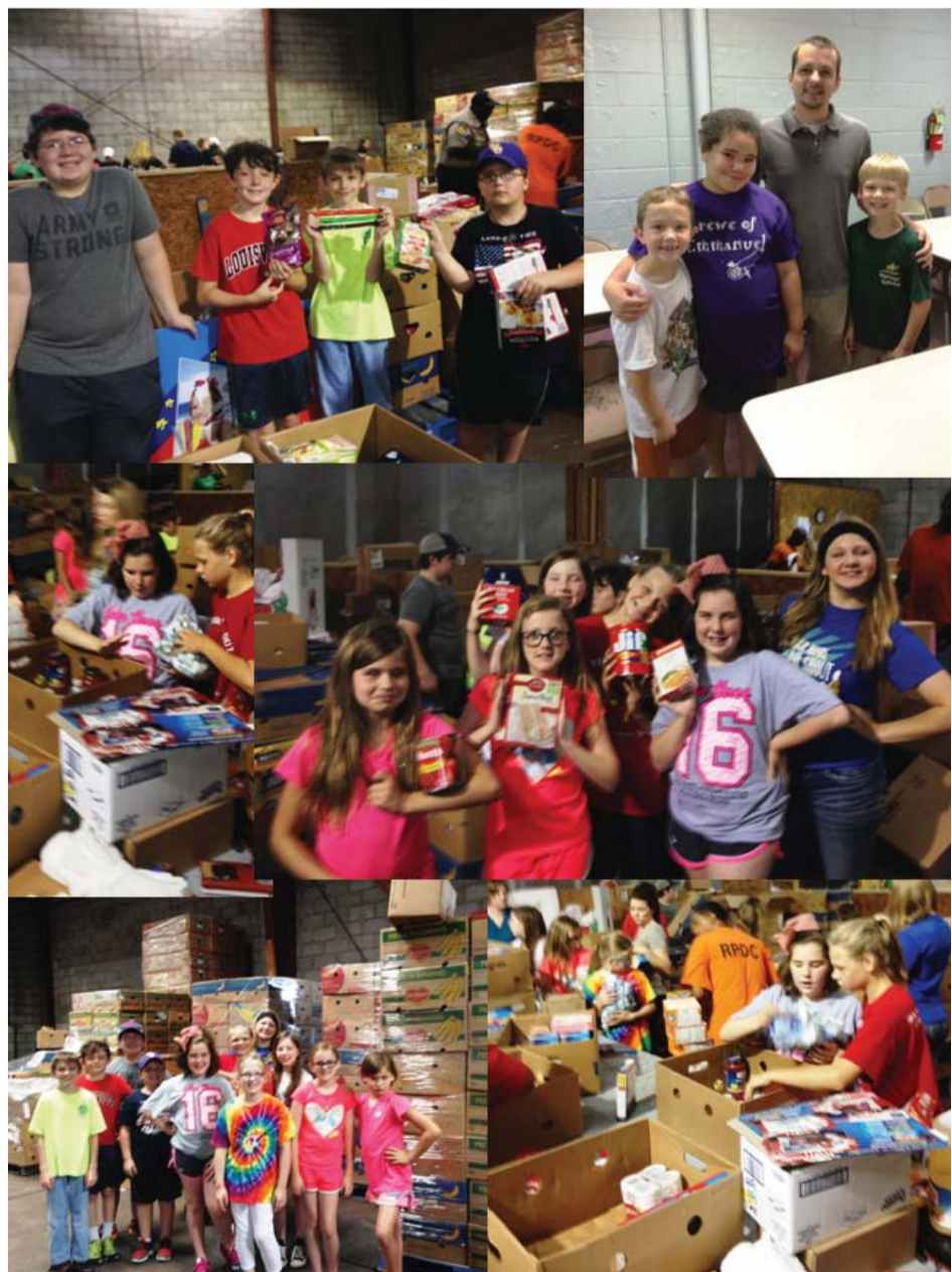
A group of Emmanuel's children spent Terrific Tuesday doing local missions.

The groups met back at Emmanuel for lunch and ice cream sandwiches to discuss what they learned from the day's experience.