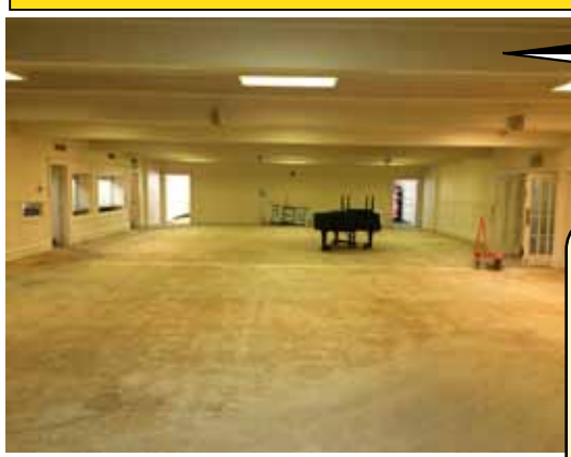
⊕ Thursday, July 7 Carpet removed from Weems Hall in preparation for asbestos abatement.