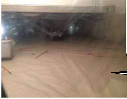
⊕ Tuesday, July 12 Weems Hall sealed and asbestos abatement in progress.