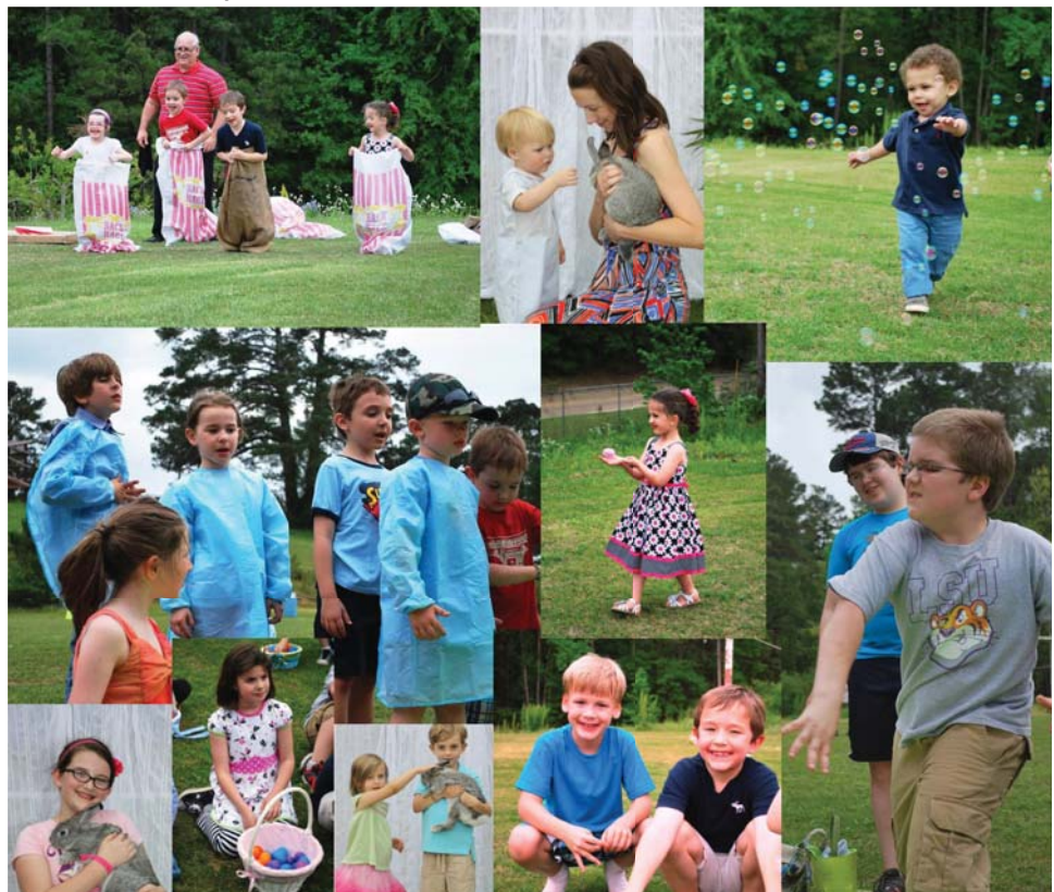
Emmanuel's children enjoyed a variety of activities on Palm Sunday.