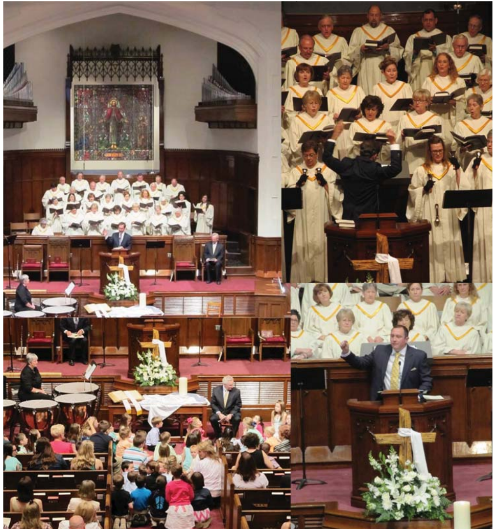
Emmanuel's Easter Sunday service wrapped up Holy Week with guest musicians, a baptism and more to celebrate Jesus' resurrection.