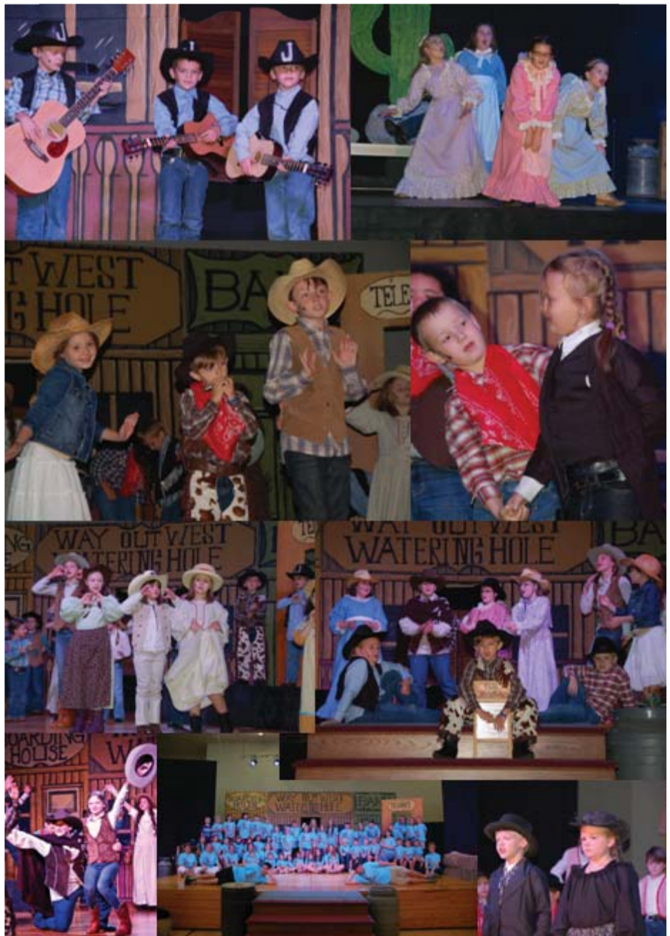
Emmanuel's Children's ministry presented Jonah's Druthers last weekend. The production was the culmination of a three-week TAG Team Camp this summer. TAG stands for Truth, Arts and Growth - the children learned about God's truth through Bible study and focused on the story of Jonah and God's redemption.